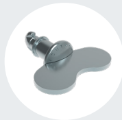
QUICK ACCESS FASTENERS