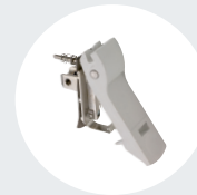
INJECT / EJECT