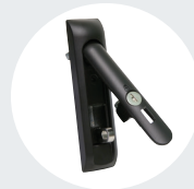
CAM LATCHES, LOCKS & SWING- HANDLES