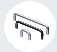
HANDLES & PULLS

Creating first impressions that last. southco.com